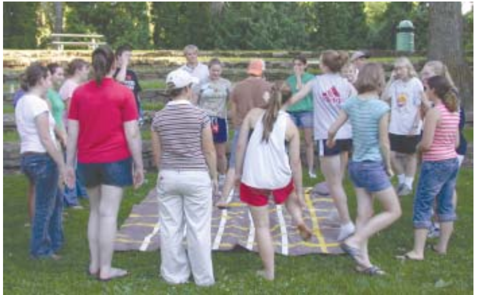
One of several groups having fun while working on leadership and team-building skills.